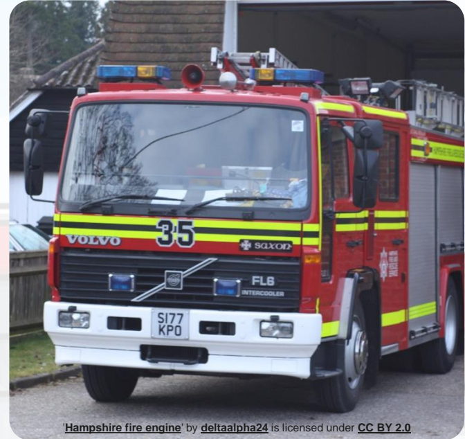
'Hampshire fire engine' by deltaalpha24 is licensed under CC BY 2.0